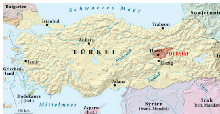
Figure 1. Map of Tunceli/Dersim. Part of the Dersim region was designated as Tunceli city for the military operation of 1937-38.

According to theories of genocide, the denial stage is ranked as the last or tenth stage of most genocides. 35 In Dersim, this stage actually preceded the genocide when the city of Tunceli was formed officially by law 2884 in parliament in 1935 (hereafter Dersim/Tunceli Law) 36 one year before the city was physically established, as show below in Figure 1. 37 Derived from the Turkish words for iron ( tunç ) and hand ( el ), respectively, the city's name carried with its connotations of the iron hand or fist (of the Turks). This is strong evidence suggesting the genocide was already being carefully planned prior to 1937-38 and Tunceli was the name given to the region where the planned genocide would take place. Thus, Tunceli and Dersim have always been two dissenting terms and political markers: while Dersim represents the name of the past, evoking Kurdishness, religious belief, and autonomy, Tunceli continues to be reminiscent of the state's intent to Turkify and Islamize, and the culmination of these efforts in the 1938 Dersim genocide.